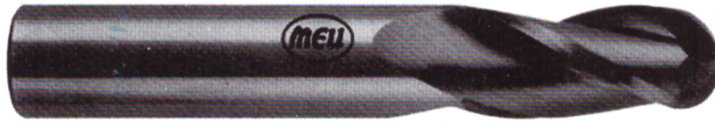
Ball Nose Micrograin Solid Carbide End Mills 3 Flute Center Cuffing 30° Helix