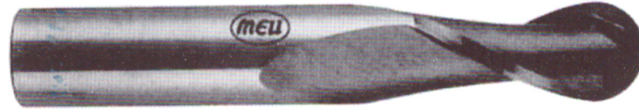
Ball Nose Micrograin Solid Carbide End Mills 2 Flute Center Cuffing 30° Helix